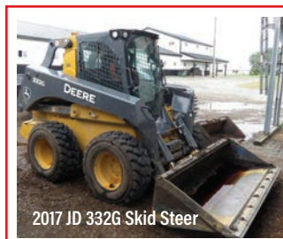
2017 JD 332G Skid Steer

One of two 2017 JD 332G skid loaders fully loaded w/cab heat & air, air ride and everything else possible! 125 & 900 hrs.