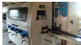
2004 Lobo 5x5 Moulder