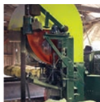
A-G TruCut Bandmill Hd. Rig