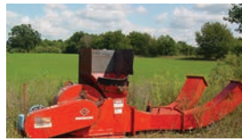
Morbark 40HP Blower