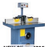
NEW Oliver 4705 Spindle Shaper