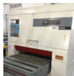
Northtech 36" Wide Belt Sander