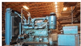
Wakaushau 150KW Natural Gas GenSet