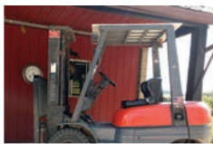
Toyota 626FD25 Forklift