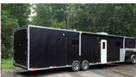
50' Gooseneck Cargo Trailer