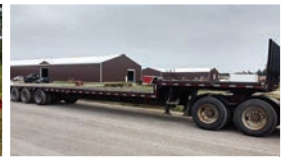
1993 Step Deck Trailer