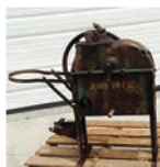
JD Corn Sheller