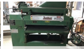
Newer Northfield 36" Planer