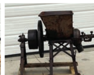
Letz Burr Mill