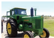
John Deere 730