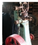
5x5 Vertical Steam Engine