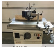
SCM T45 1-1/4" Spindle Shaper