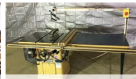
Powermatic #66 Table Saw