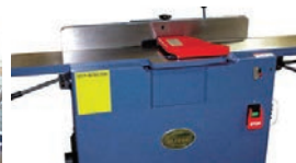
NEW Oliver 0008 8" Parallelogram Jointer