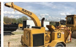
2016 Rayco RH1754-20 Grinder