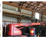
1980 Condor 406N 40' Manlift