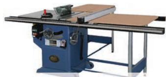
NEW Oliver 4016 10" Table Saw