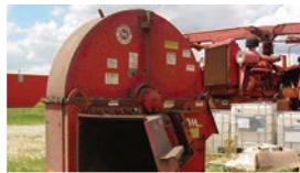
Morbark 83" Stationary Chipper