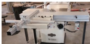
Shop Fox Sliding Table Saw