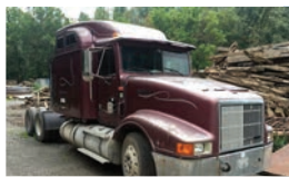
1996 International w/CAT 485