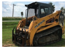
Mustang MTL20 Loader