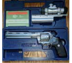
Colt, Ana Conda 44 mag.