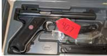
Ruger Mark III