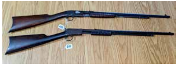
Rem. mod. 121 22 cal. Win. mod. 1890 22 cal.