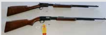
Winchester mod. 62A-61 22 cal.