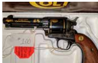
Colt, Buffalo Bill