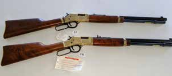
Henry's 357 mag./44 Colt