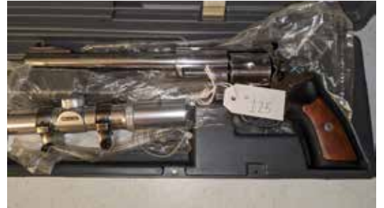
Ruger, Super Red Hawk 44 mag.