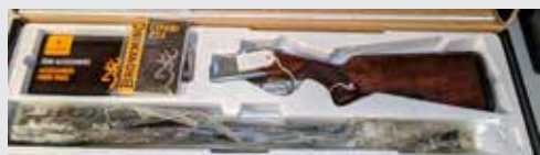
Browning Citori 12 ga. O/U NIB