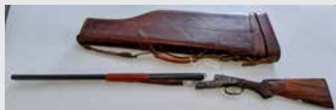
LeFever mod. C Grade 16 ga. SxS