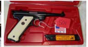
Ruger Mark II 22LR NRA Edition