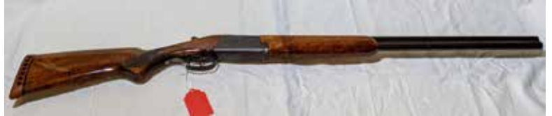
Browning, Citori O/U 12 ga.