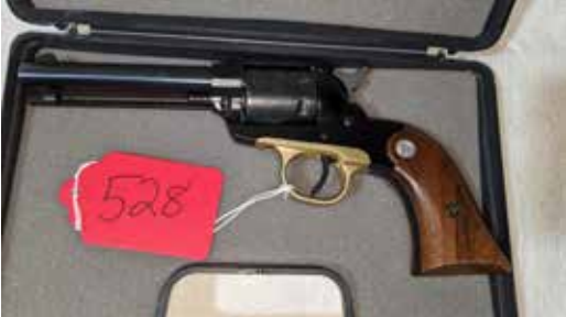
Ruger, Bear Cat. 22 cal.