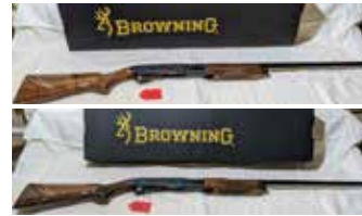
2-Brownings BPS Medallion 28 and 16 ga.