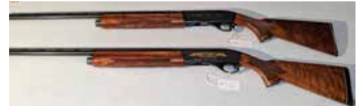
Rem. 1100's LT-20 "Tournament Skeet"