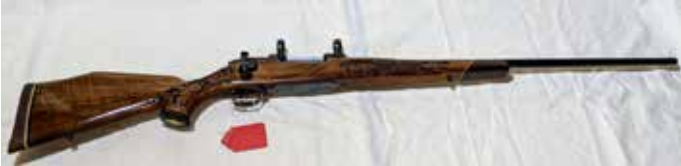
Weatherby Mark 300 WBY Mag.