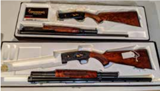
Brownings Grade V 28& 20 ga.