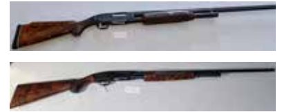
Win. mod. 42 & 12 "Pigeon Grades" (Very Rare!)