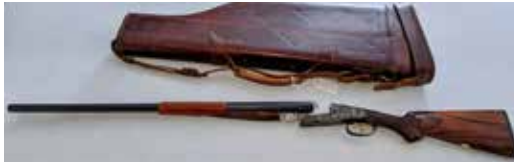
LeFever Grade C 16ga SxS W/Leather Case (Rare!)