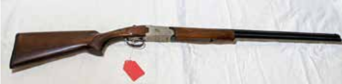
Browning, Lightning O/U 12 ga.