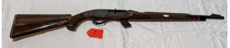
Rem. mod. 10-C Mohawk 22 cal.