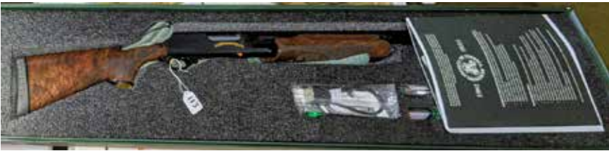
Remington 890 WM 200th Anniversary