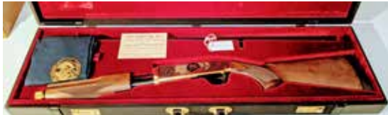
Browning 12ga Pheasants Forever #64 of 100

Private Collection of (175 Guns) & (35+Collector Knives)