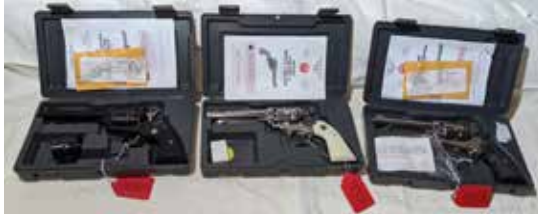
Rugers, Black Hawk & Vaquero