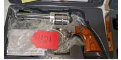
Ruger, Single 10 22 cal.