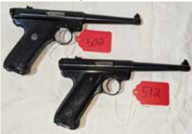
Ruger Mark II