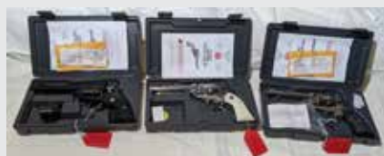
Rugers Black Hawk and Vaquero