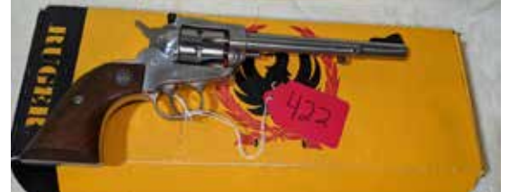
Ruger, Single 6 22 cal.