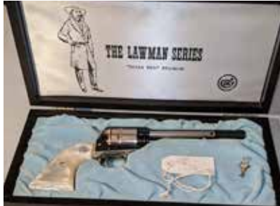
Colt 22 cal. Wild Bill Hickok