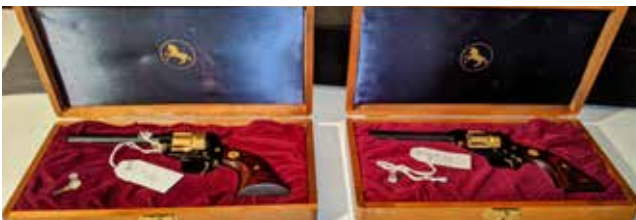
Colt Revolvers 49er Miners