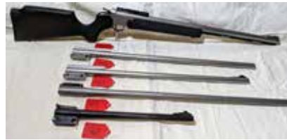
T/C Encore multiple barrels