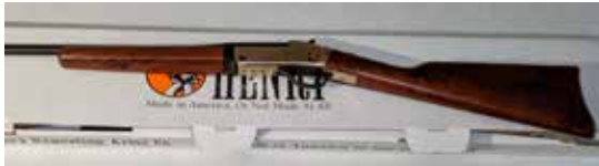
Henry 410 ga. NIB