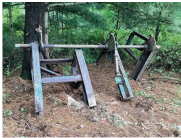
#226 Log Kicker 13' Wide x 5' High