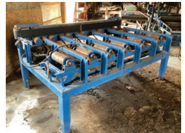
#196 Shop Built Turn Around Conveyor For Baker Resaw In Excellent Condition, Hydraulic Powered