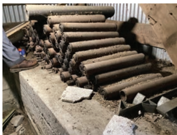
#266 Quantity Of Various Sizes of Replacement Rollers