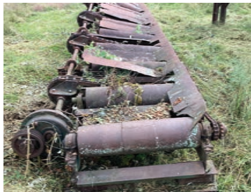
#210 Live Rolls 32' Wide Rolls x 27' Long