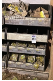
#254 Stanley Hooks, Locks And Door- stops Display And Contents