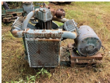
#234 Ingersoll-Rand Model 40 Air Compressor with Electric Motor