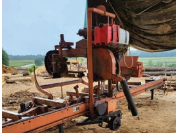
#191 2001 Woodmizer LT40 Hydraulic Sawmill, 3300 hrs, Acusset setworks, debarker, waterlube wheels, 25 hp Command Kohler, 15 extra blades, cuts 28" x 21' logs, good condition.