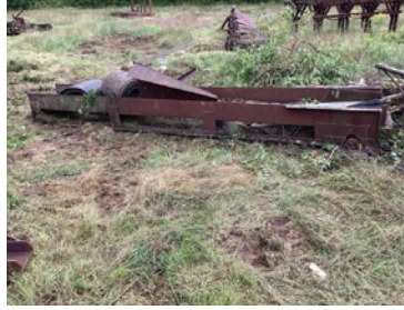
#223 Belt Conveyor 22" Wide x 15'6" Long