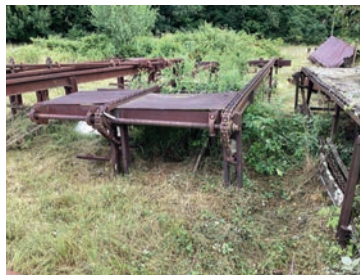
#215 2 Strand Transfer Deck 7' Wide x 23' Long x 40' High