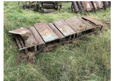
#212 Live Rolls 32' Wide Rolls x 17' Long