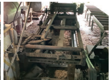
#204 Frick Gang Edger with Infeed and Outfeed Roll Conveyors, Line Shaft Powered