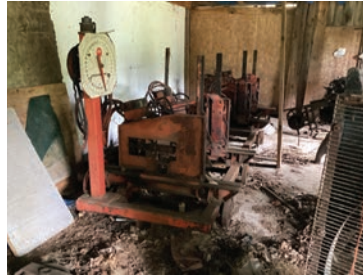
#206 Morbark 4 Head Block Carriage