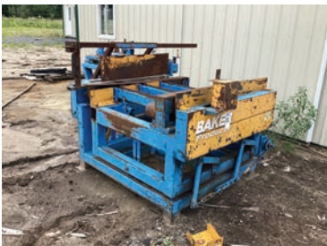
#197 Baker Model RT-0 Turn Around Conveyor