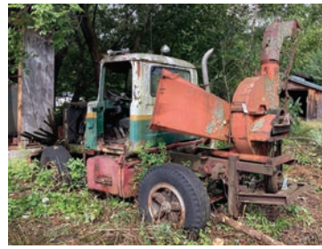
#207 Normet Model CH231 Chipper Mounted on A Mack R-600 Truck