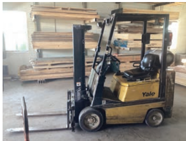
#194 Yale Model GLC040AFNUAF074 Forklift, 4000 Lbs. Capacity, 2 Stage Mast, Solid Rubber Tires