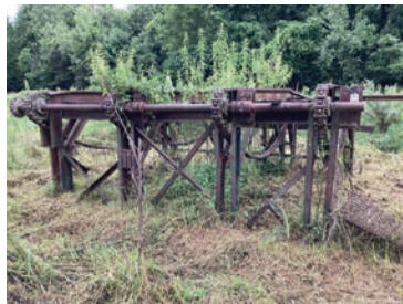
#231 4 Strand Transfer Deck 13' Wide x 12' Wide x 5' High