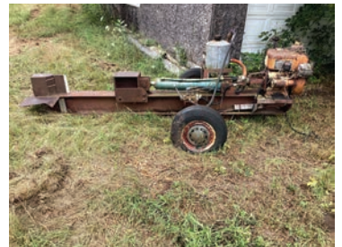
#232 Shop Built Log Splitter with Wisconsin Model THD Engine