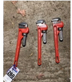
#260 3 Fuller 14" Pipe Wrenches