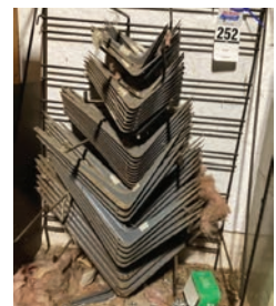
#252 Metal Shelf Bracket Display Filled With Various Sizes of Brackets