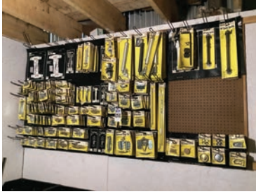
#253 Stanley Hardware Display Contents, Pneumatic Door Closers, Door Hinges, Gate Latches and More