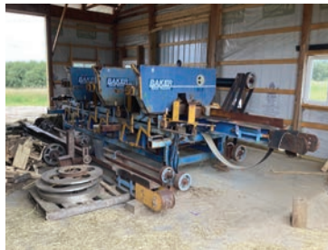
#195 Baker Model BBR-0 Resaw, 3 Head With Return Conveyor, Needs Refurbished