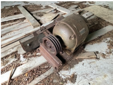
#229 General Electric Model 5k326d49 Electric Motor, 20 Hp, 220/440 Volt 3 Phase