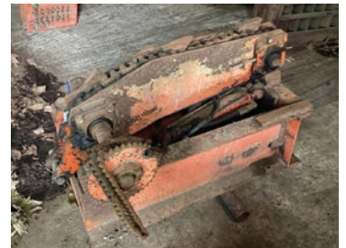
#264 Morbark Log Turner