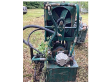
#235 Tyrone-Berry Model SMA-215 Hydraulic Power Unit