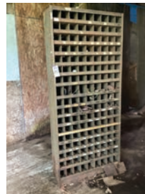
#263 Metal Bolt Bin