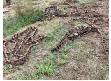
#224 4 Transfer Deck Chains