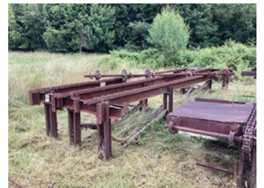
#216 3 Strand Transfer Deck 5' Wide x 23' Long x 40' High