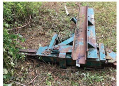
#236 Corinth Model 4-30 Log Turner