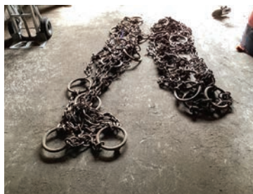
#267 2 Bear Claw Skidder Tire Chains