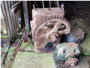
#241 Cleveland Gearbox, Electric Motor, Gear Box