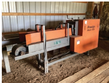
#199 Froedge Model LBD 450 Deduster