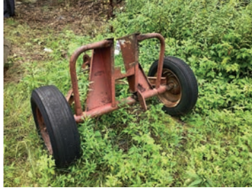
#238 Log Cart