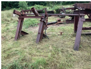
#214 Log Kicker