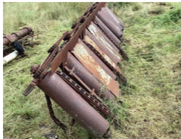
#211 Live Rolls 32' Wide Rolls x 17' Long