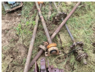
#219 4 Transfer Deck Shafts and 2 Beam Mounts