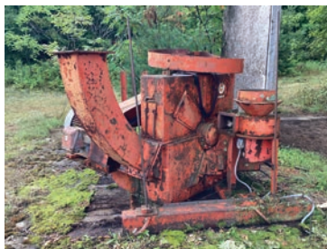
#202 Morbark Model 3-48 Chipper