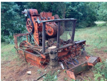
#201 Morbark Debarker with Infeed and Outfeed