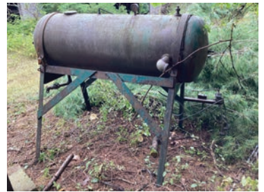
#228 Tank With Stand 2' x 6' Long x 5' High