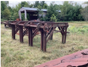
#209 4 Strand Transfer Deck 11' Wide x 10' Long x 5' High