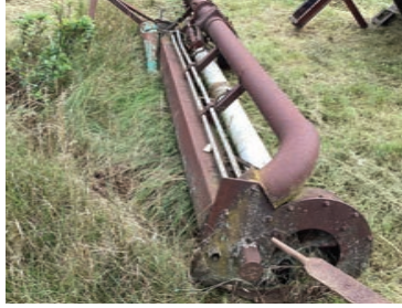
#222 Manure Pump