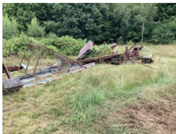
#218 Large Scrap Pile