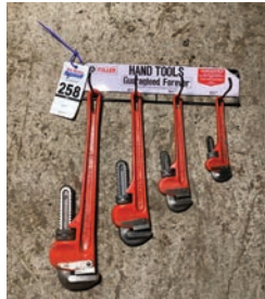
#258 4 Fuller Pipe Wrenches and Store Display, 18", 14", 10" and 8" Pipe Wrenches