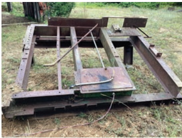
#225 Beam Equipment Mounting Deck