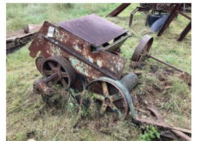
#220 Edger For Parts