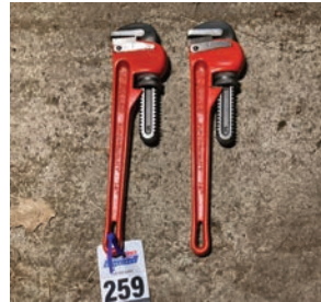
#259 2 Fuller 14" Pipe Wrenches