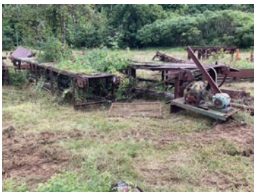
#217 4 Strand Transfer Deck 13' Wide x 29' Long x 42' High