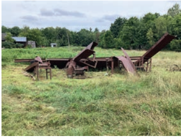
#221 Scrap Pile, Belt Conveyors, Steel Decks, I Beams