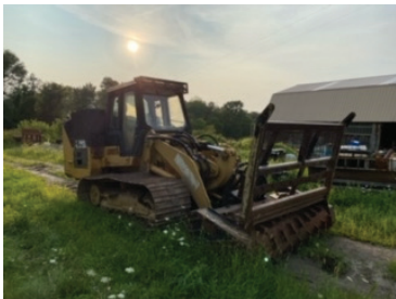
#193 Cat Model 953 Supertrak Track Loader With Fecon Mulching Head, Under 500 Hours On New Mulching Drum