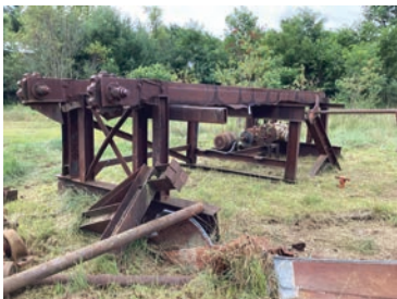
#213 2 Strand Transfer Deck 4' Wide x 22' Long x 6' High