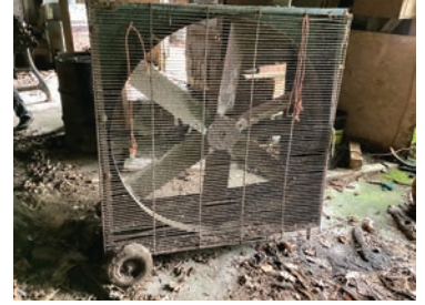
#240 Electric Fan