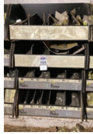
#255 Stanley Mending Plates, Tee Plates Display and Contents