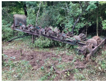
#227 Live Hourglass Log Rolls 26" wide Rolls x 20' Long with Left and Right Kickers