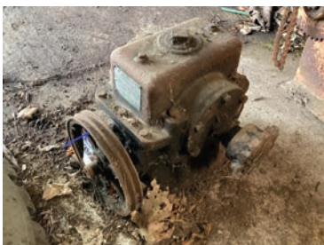
#265 Philadelphia Gear Works Gear Box