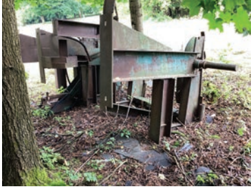
#237 Log Kicker 13' Wide x 4' Long x 5' High