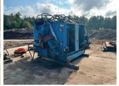
#192 Forano Model SB-326 L Ring Debarker In Good Working Condition