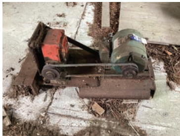
#230 Reliance Model 213TZ electric motor with Radicon Gear Box