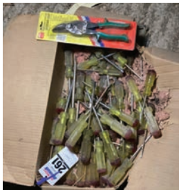
#261 Box Lot Fuller Flat and Phillips Screw Drivers, Fuller Aviation Snips