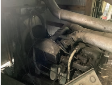
#205 Mack Model E7-300 Deisel Power Unit with 18 Speed Transmission