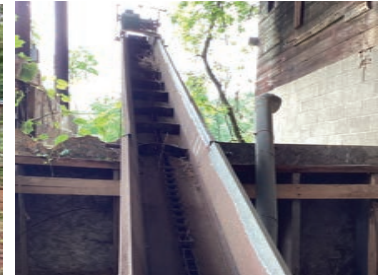
#208 10' x 26' Shavings Elevator