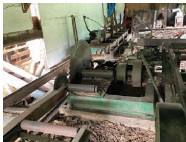
#203 Lane 3 Headblock Carriage Circular Sawmill Setup with 50' of Track, Line Shaft Powered