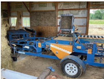
#198 Baker Model BE-0 Portable Edger with Isuzu Deisel