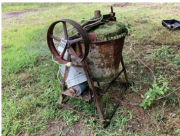
#233 Cement Mixer