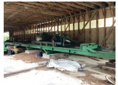
#200 Corinth American Circular Sawmill With 3 Headblock Carriage, Operators Cabin, 70' Of Track