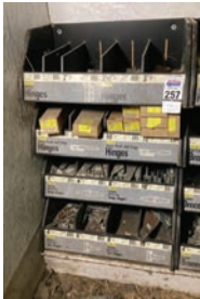
#257 Stanley Utility Hinges, Hook and Strap Hinges, Strap Hinges, Tee Hinges Display and Contents