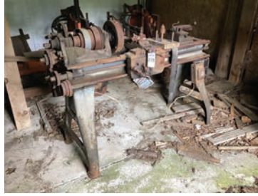
#239 Syracuse Metal Lathe